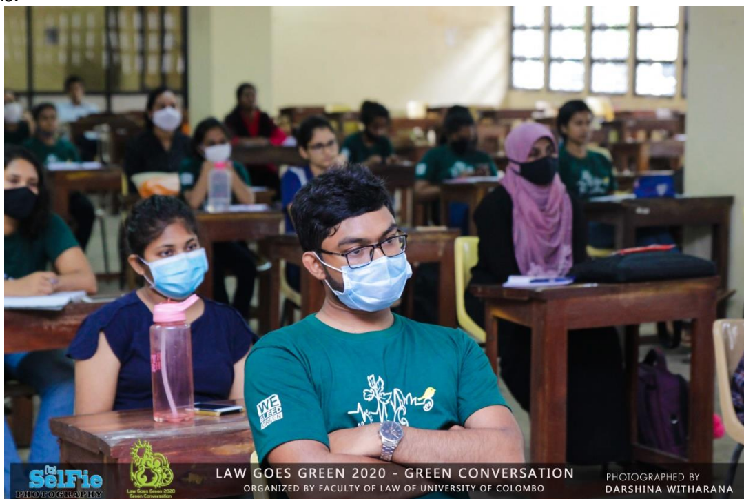
Final year students in all three media at LGG 2020