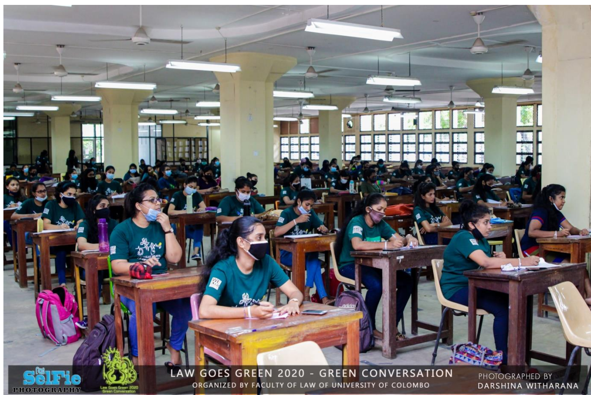
Active engagement by the participants at LGG 2020